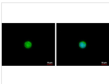
GTX110520 ICC/IF Image

Non-transfected (-) and transfected (+) 293T whole cell extracts (30 µg) were separated by 12% SDS-PAGE, and the membrane was blotted with TNF alpha antibody (GTX110520) diluted at 1:1000. The HRP-conjugated anti-rabbit IgG antibody (GTX213110-01) was used to detect the primary antibody.